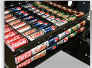
Patented High Capacity Can Tray

Features live product display and holds up to 150-12oz. cans.