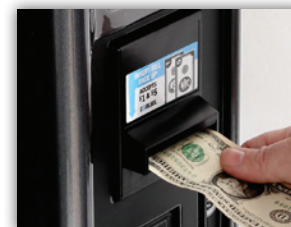
Premium Currency Acceptors

Keeps customers satisfied and reduces service calls for misloaded product.