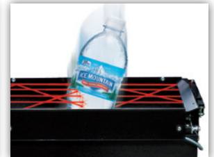
iVend® Guaranteed Delivery System

Keeps customers satisfied and reduces service calls for misloaded product.