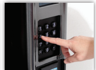
Large and easy to read selection buttons with Braille identification.

Includes standard electronic coin acceptor and $1 & $5 bill acceptor.