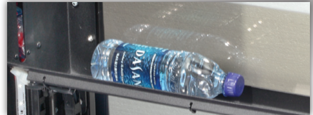
Elevator Gently Delivers a Wide Range of Beverage & Dairy Products