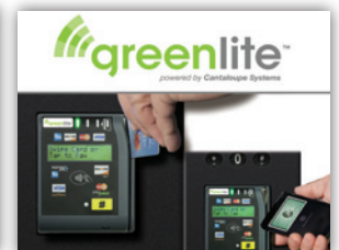
Credit/Debit & mobile reader options.

Hold up to 60 canned or bottle beverages.