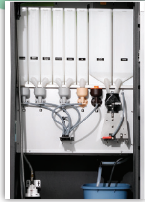
State-Of-The-Art Brewing System Simple brewing system and filtering ensure a high quality, consistent drink (No Filter Paper Required)