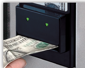
Premium Currency Acceptors

Keep your customers happy by with all their favorite chips, crackers, cookies, candy & confections.