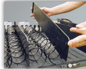
Re-configure trays to almost any package size in the field with no need for tools.