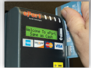
Credit/Debit card reader options.