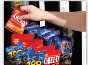
Dispenses All Brand Name Products

Keeps customers satisfied and reduces service calls for misloaded product.