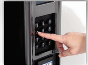
Large and easy to read selection buttons with Braille identification.