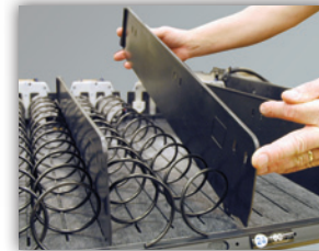
Re-configure trays to almost any package size in the field with no need for tools.