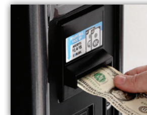
Premium Currency Acceptors

Keep your customers happy by with all their favorite chips, crackers, cookies, candy & confections.