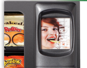
Back lighted point of sale window for advertising and specials.