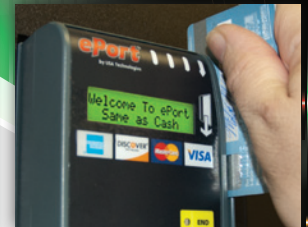
Credit/Debit card reader options.