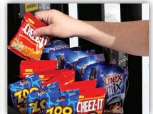
Dispenses All Brand Name Products

Keeps customers satisfied and reduces service calls for misloaded product.