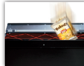
iVend® Guaranteed Delivery System

Keeps customers satisfied and reduces service calls for misloaded product.