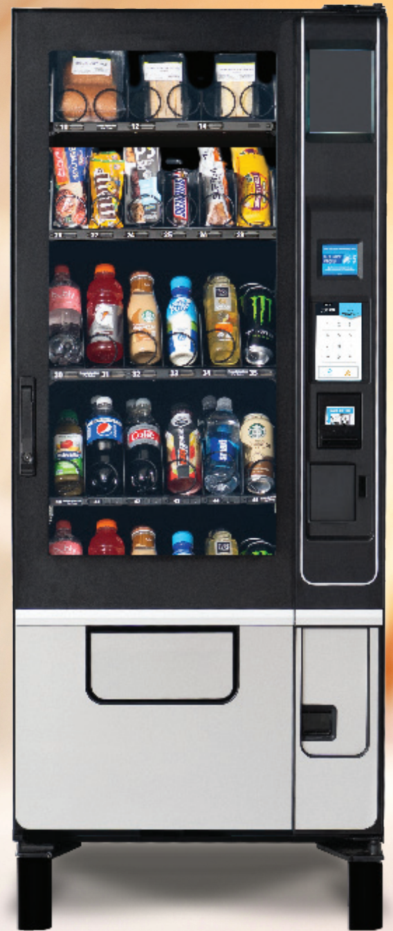
Evoke ST3 shown with optional 7" Touch Screen and standard Leg Covers

The refrigerated merchandiser designed for performance and built to last