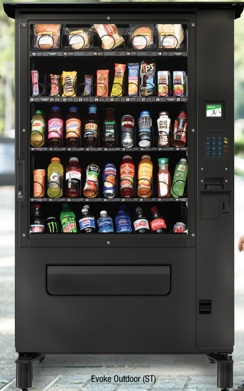
Evoke Outdoor (ST)