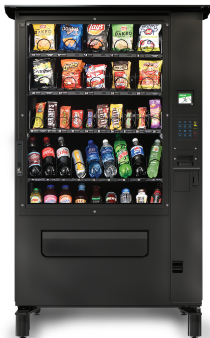
Evoke Outdoor (VT)