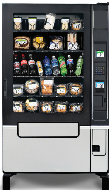
Shown with standard 3.5" Display, Braille Identified Keypad and Leg Covers