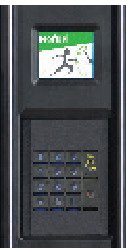
Braille Keypad Standard