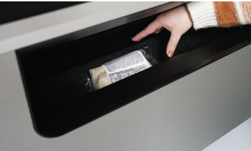
Sell Salads, Sandwiches and more!